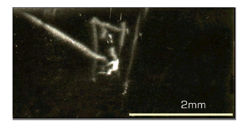
Figure 2. Autoradiography of charged particles tracks of beta delay isotopes on the surface palladium cathode. Some tracks of beta particles are paralleling the cathode surface.